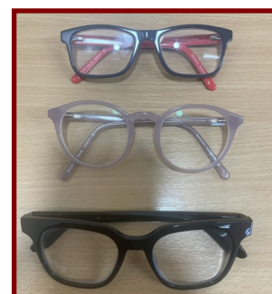
Glasses awaiting collection from the school office

Please, please, please label your child's items with their name; labelled items are so much easier to reunite with their owners. Thank you.